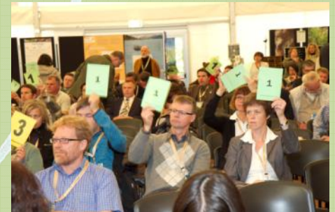
Pictures top to bottom: EUROPARC Council 2009, EUROPARC Directorate, EUROPARC General Assembly 2010