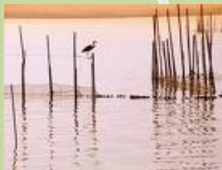
La Albufera Spain