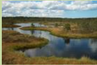
Kemeri , Latvia