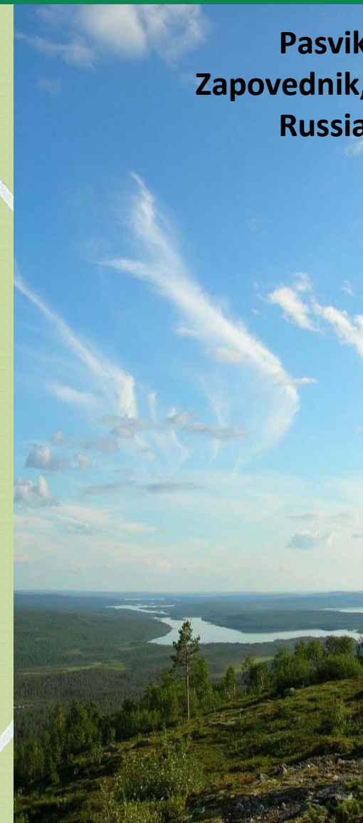
Pasvik Zapovednik, Russia

•promotion of the nature protection and preservation of the cultural values and sustainable management of the protected areas.