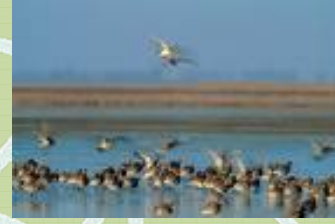
Ferto Hansag Hungary