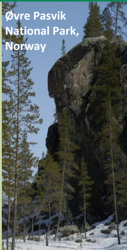
Øvre Pasvik National Park, Norway

A trilateral transboundary park for Peace and Understanding